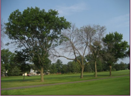
Healthy Ash trees protected with Tree-age untreated Ash trees killed by Emerald Ash Borer.

Without treatment, all Ash Trees with Emerald Ash Borer die within 3-5 years. Emerald Ash Borer kill Ash Trees when larvae tunnel beneath the bark, stop food and water and starve the tree to death.