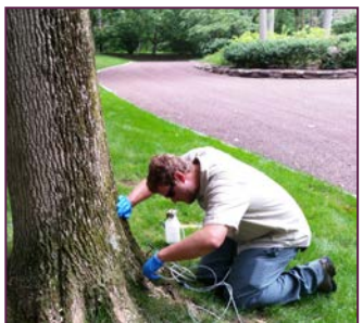
Trunk injection is the most effective treatment for Emerald Ash Borer. The insecticide provides protection for two years.

2. <u>Soil Injection/Soil Drench</u>: Applied to the soil at the base of the tree, the insecticide, Merit® or Xytec® with Imidacloprid, is absorbed up through the canopy. Control has been inconsistent. Experience and research indicate that this treatment is most effective on smaller trees. The treatment must be applied annually in mid-late Spring or mid-Fall.